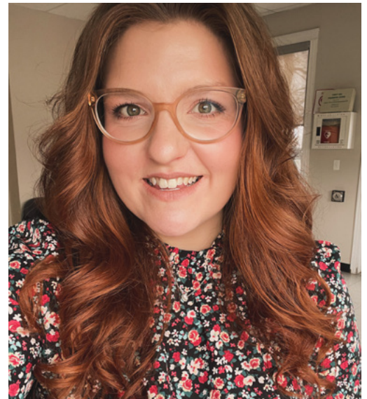
Sydney Haines Bursary Recipient